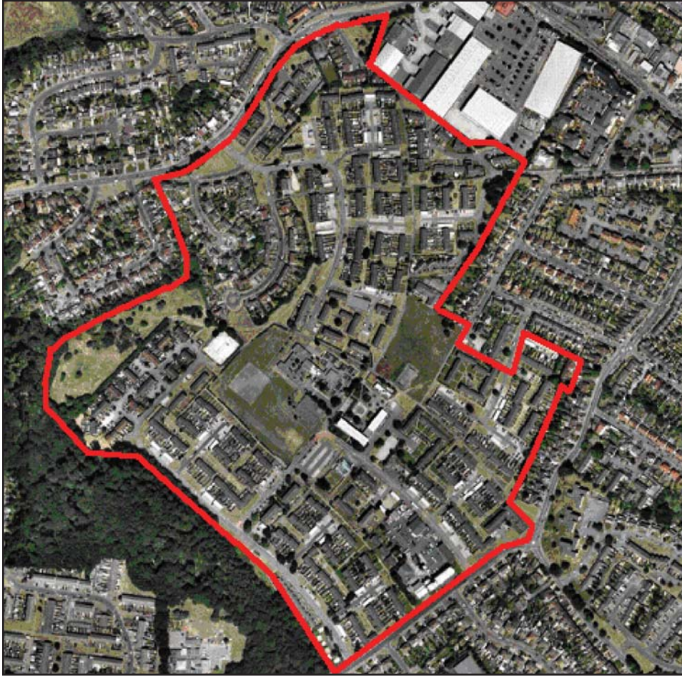
Aerial photograph of Dee Park (Plan 2)