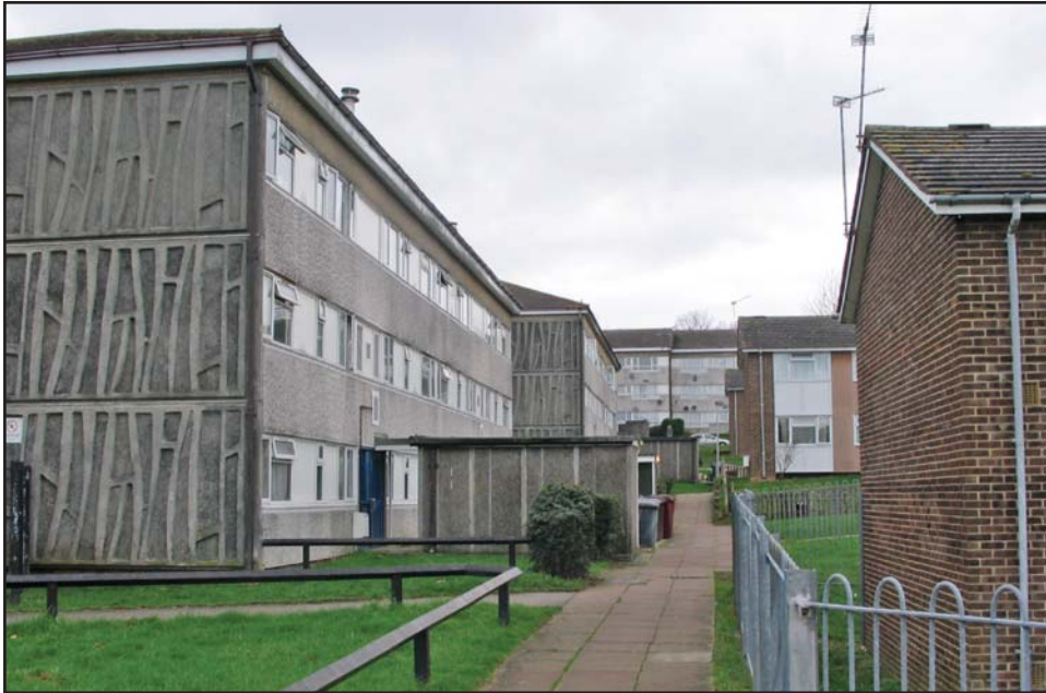
Three and two storey flats, Dee Park