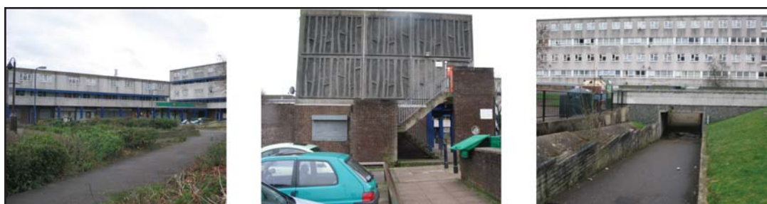
Views of the Estate