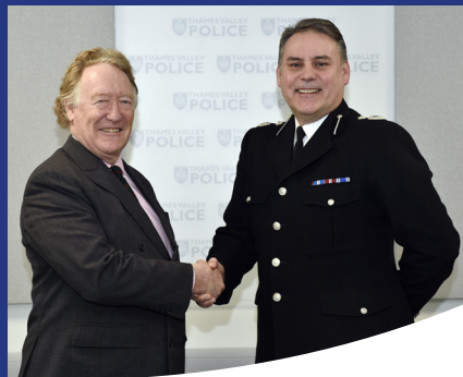
Anthony Stansfeld Police and Crime Commissioner for Thames Valley 2012 – 2020