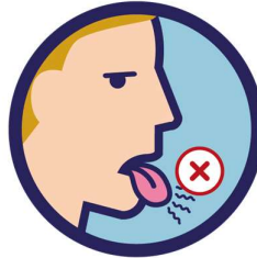
LOSS OF TASTE