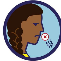
NO SENSE OF SMELL