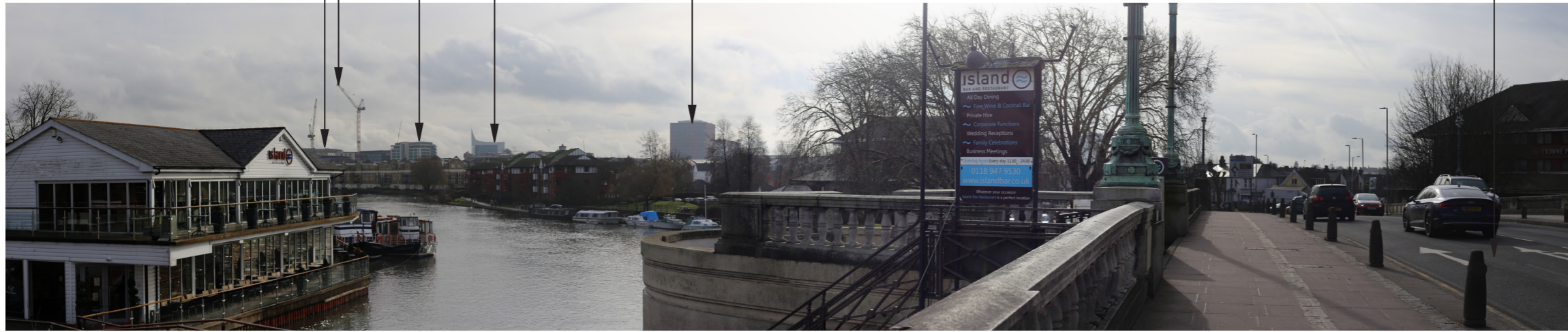
SITE CONTEXT PHOTOGRAPH 10: VIEW SOUTH-EAST FROM CAVERSHAM BRIDGE

Approximate extent of the Site Construction activity on Napier Road Reading Bridge House 3 Forbury Place The Blade Thames Tower Caversham Bridge