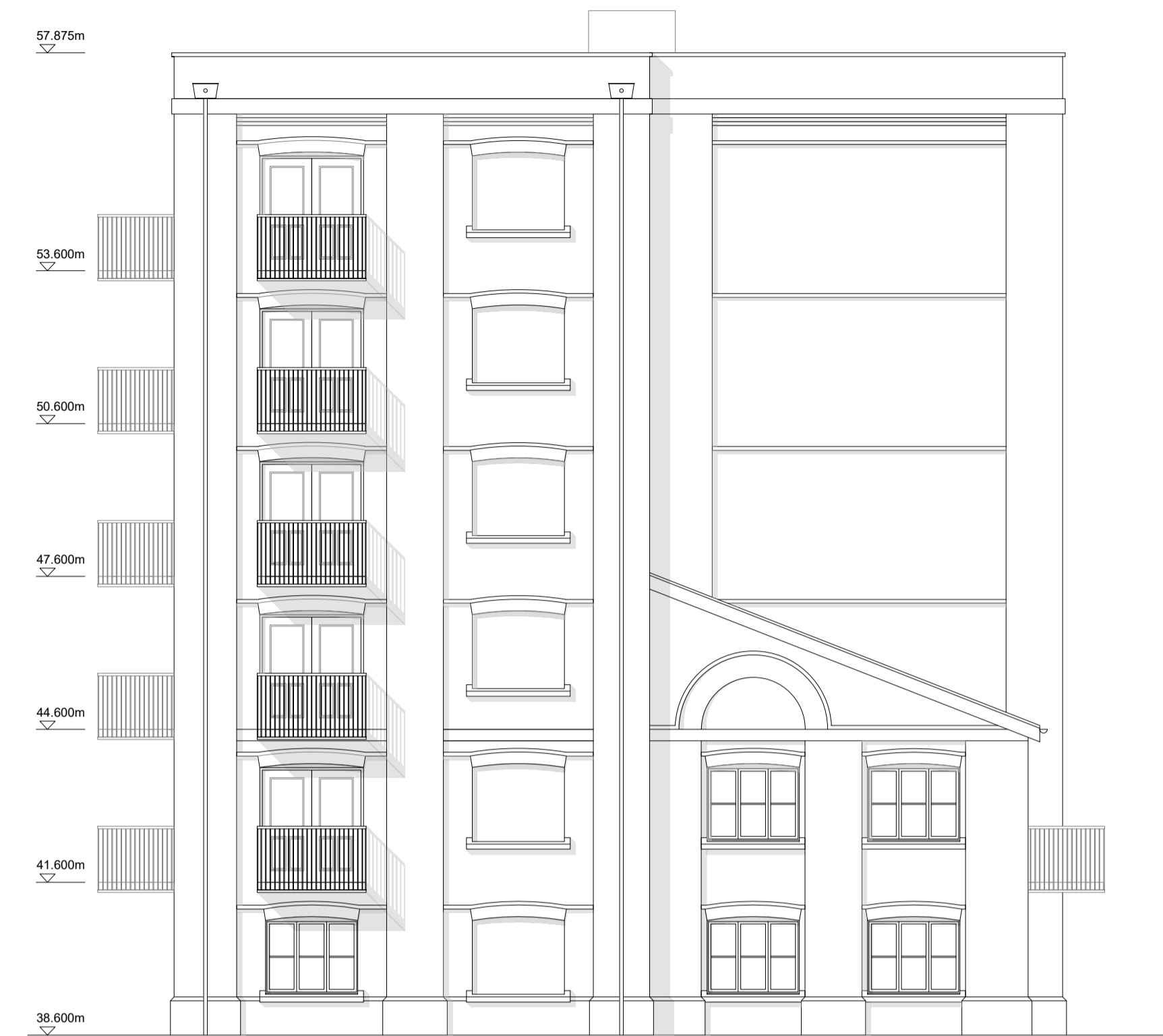
Southeast Elevation 2-2