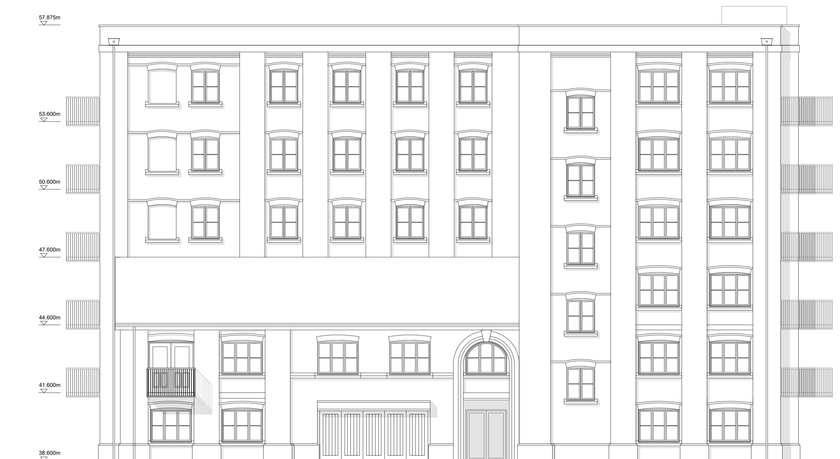
Northeast Elevation 3-3