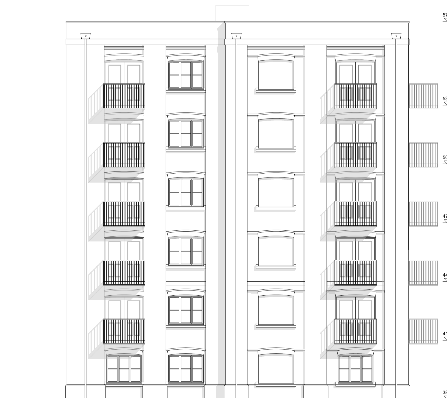
Northwest Elevation 4-4