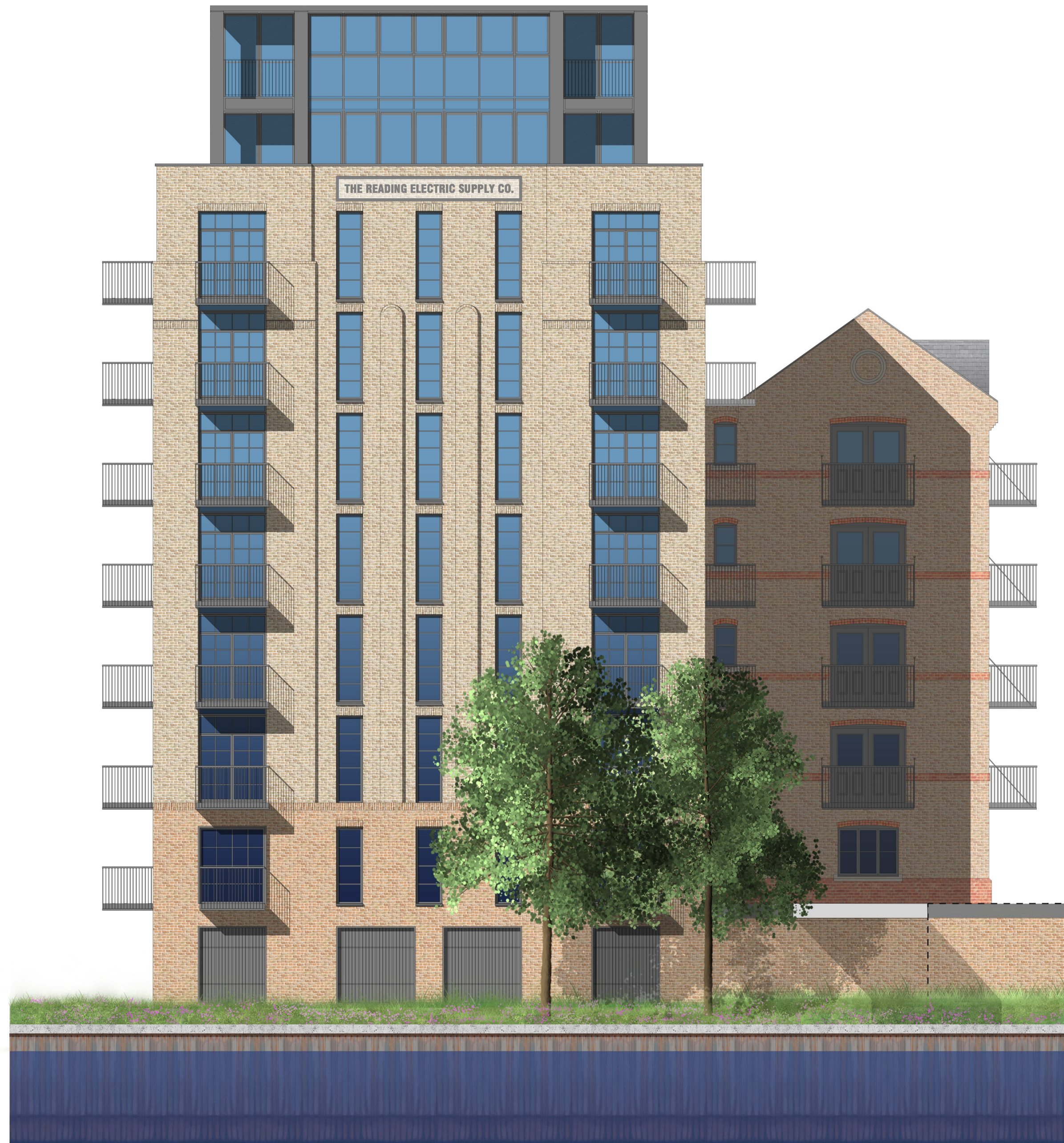
Northeast and Southwest Elevation