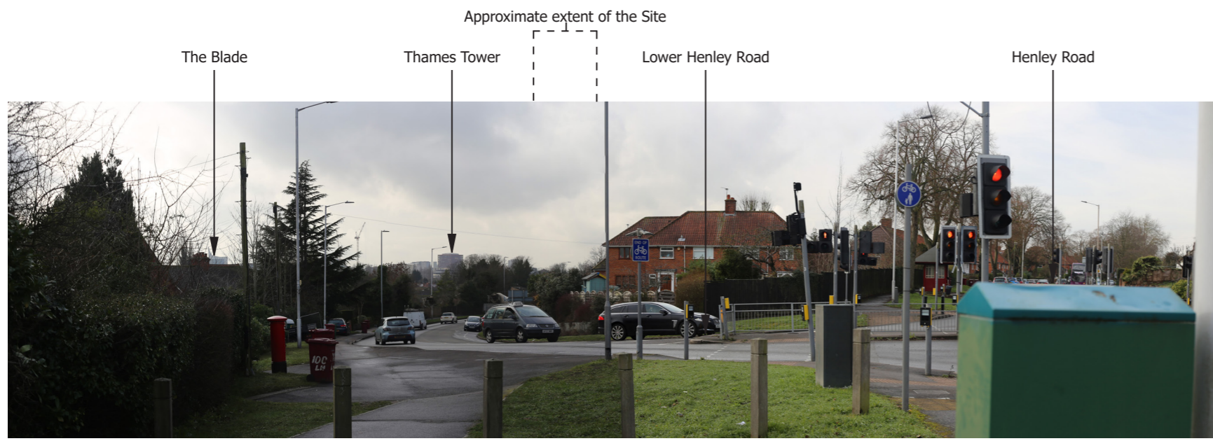
SITE CONTEXT PHOTOGRAPH 19: VIEW SOUTH-WEST FROM HENLEY ROAD JUNCTION WITH LOWER HENLEY ROAD