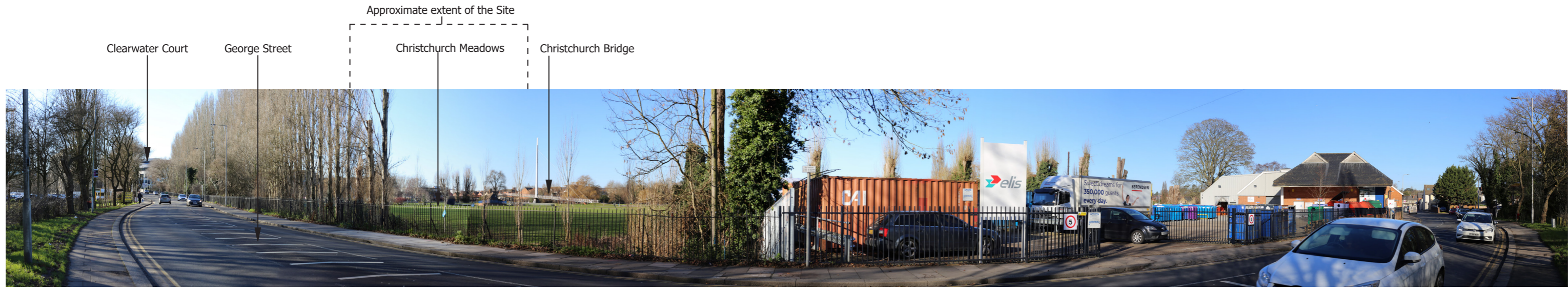
SITE CONTEXT PHOTOGRAPH 18: VIEW WEST FROM GEORGE STREET