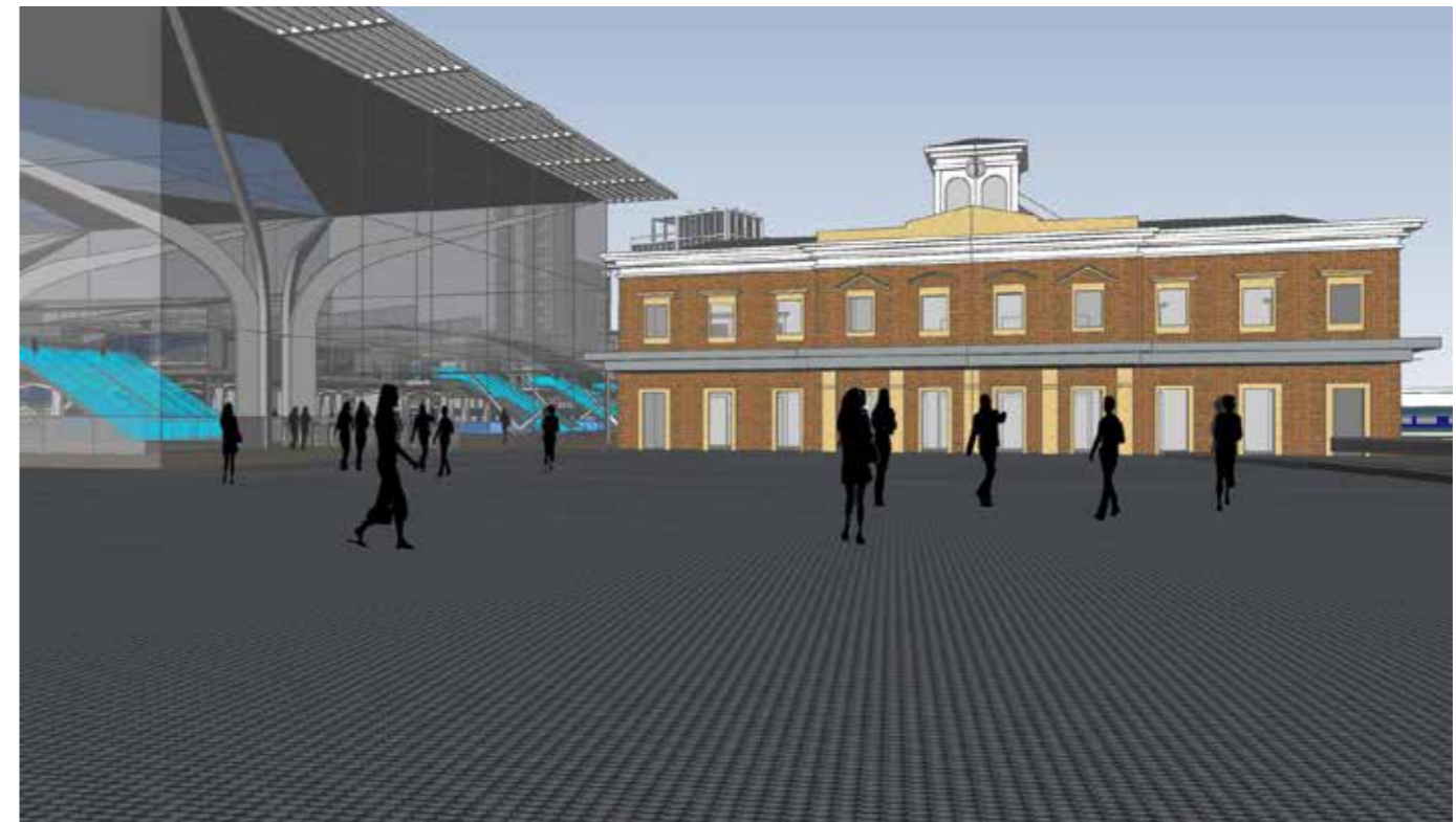
LF Figure 4. RSAF Scheme Station Road View -west-side pavement