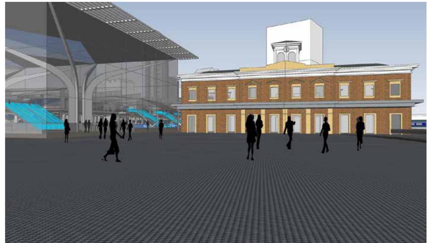
LF Figure 2. Illustrative Scheme Station Road View -west-side pavement