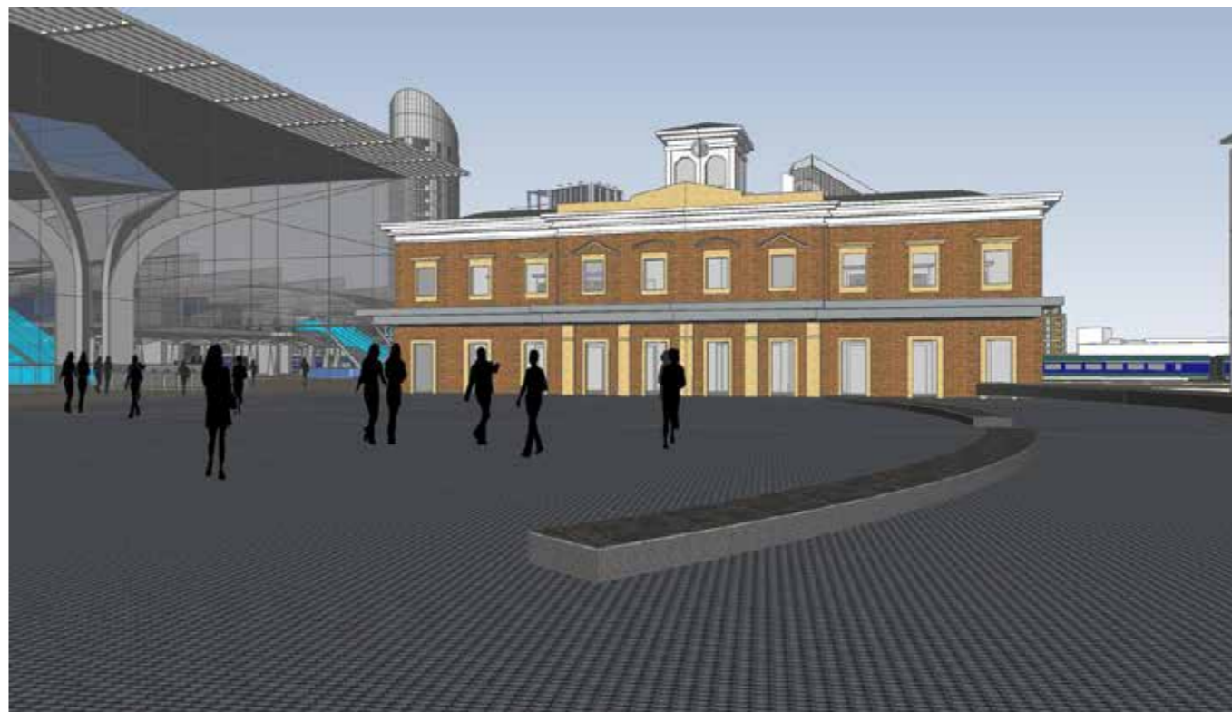
LF Figure 3. RSAF Scheme Station Road View -middle of street