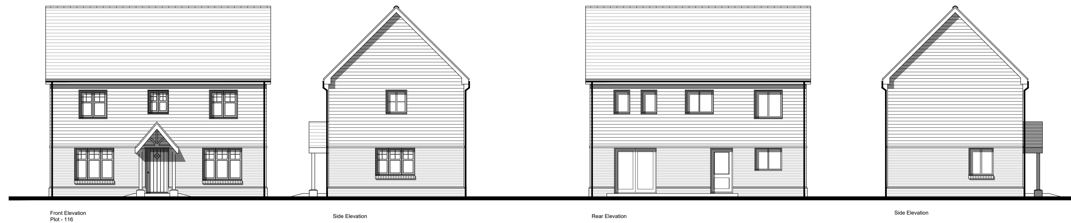
Front Elevation Plot - 116