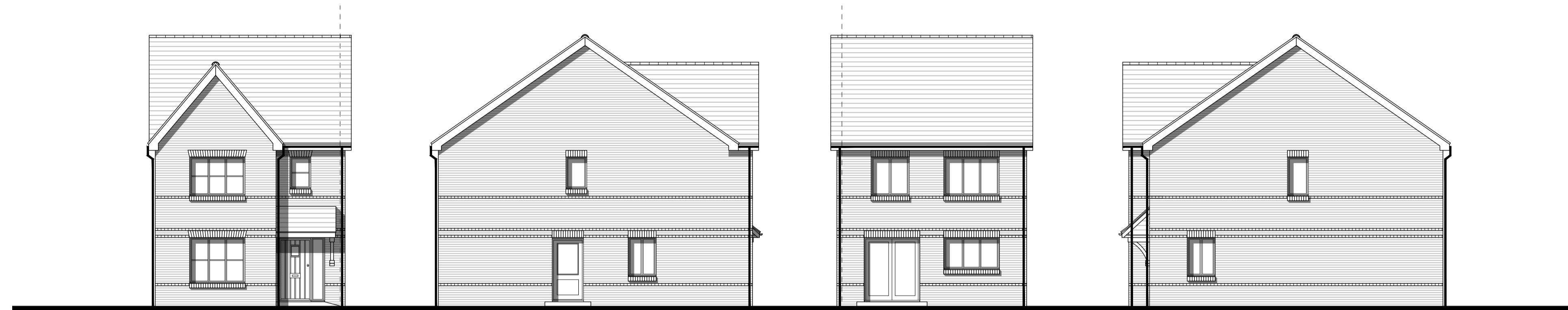
Front Elevation Plots - 26 Handed - 9, 25