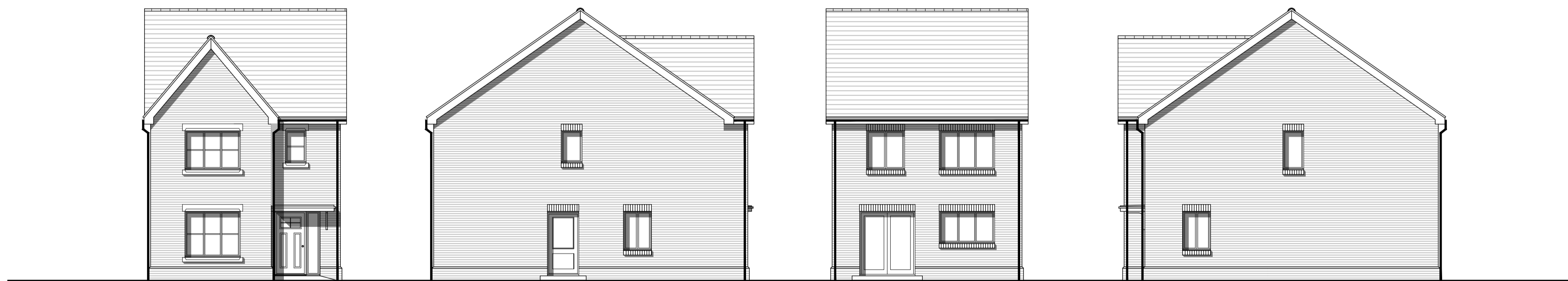
Front Elevation Plot - 119, 140