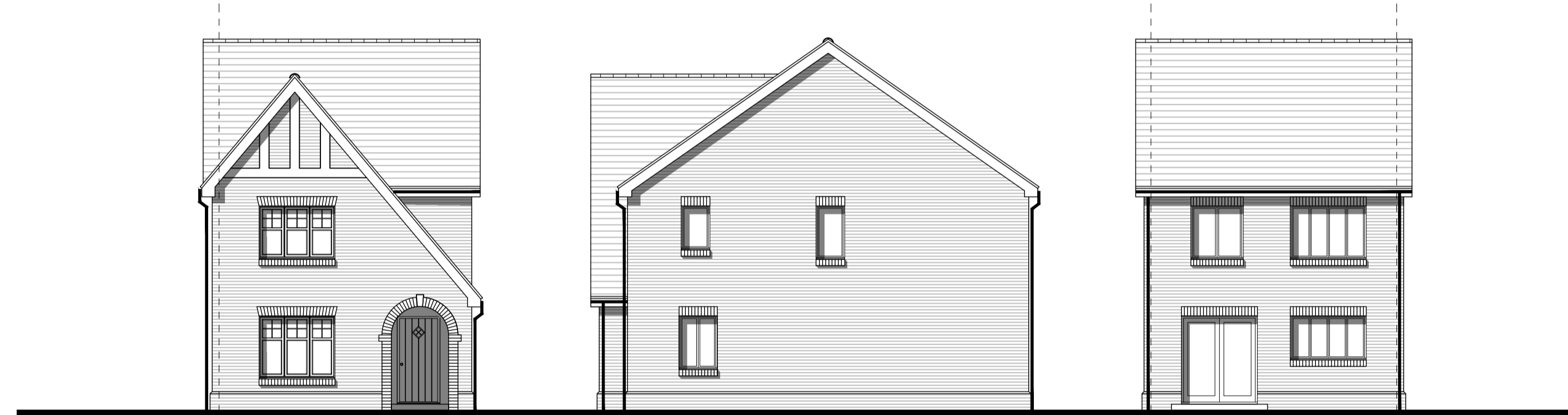
Front Elevation Plots - 113 Handed - 114