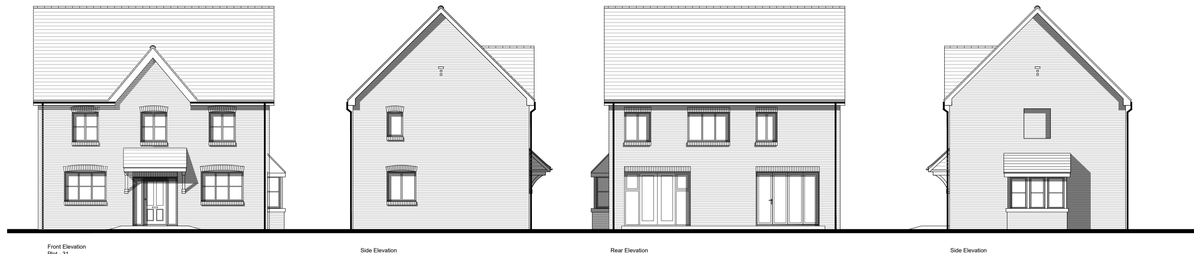
Front Elevation Plot - 31 Spine