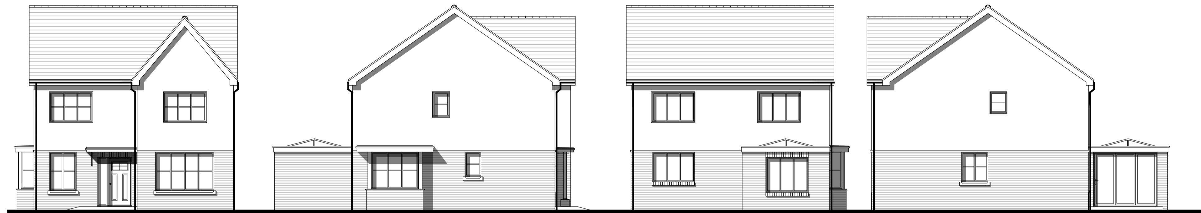
Front Elevation Plots - 141 Handed - 129