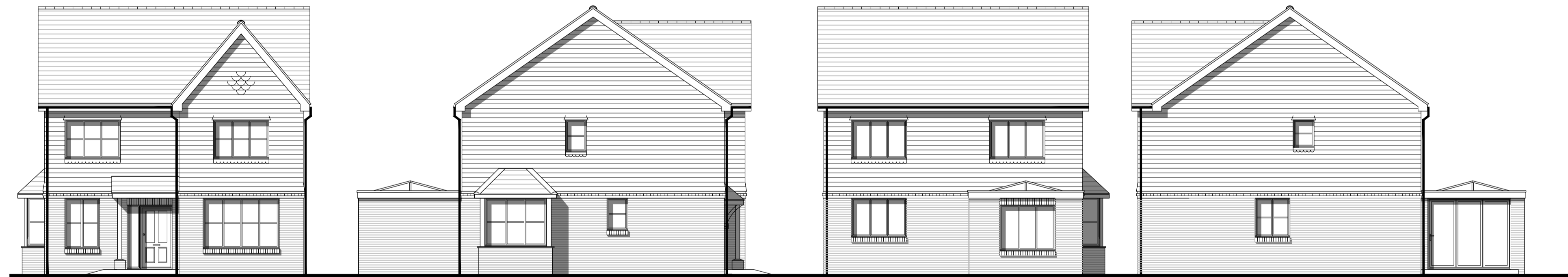
Front Elevation Plot - 45