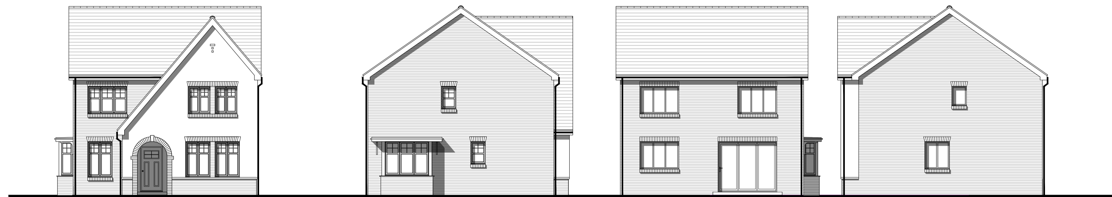
Front Elevation Plot - handed - 2