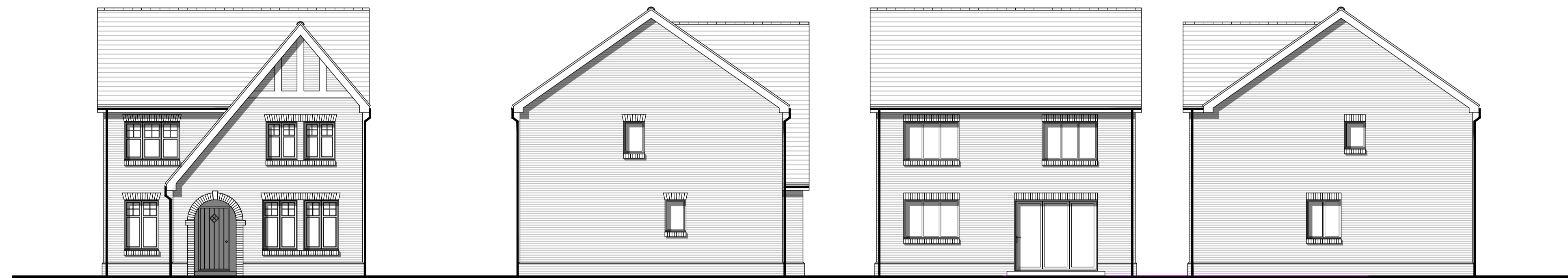
Front Elevation Plots - 109, 115