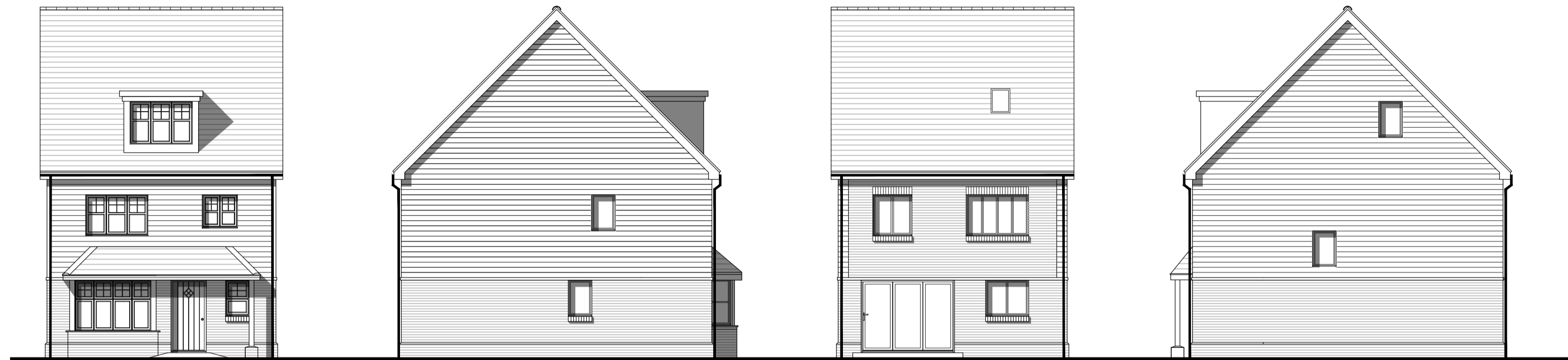
Front Elevation Plots - 160, 157 Handed - 150, 156

4-Bedroom House 135.38sqm / 1457.0sqft GIA Plots - 40, 42, 121, 157, 160, 161 Handed - 39, 41, 120, 150, 156