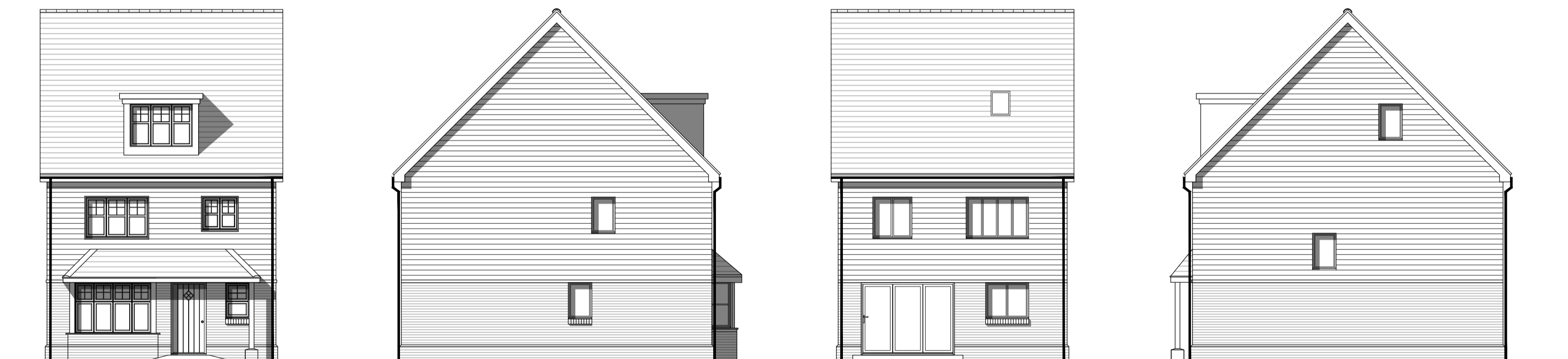
Front Elevation Plot - 161