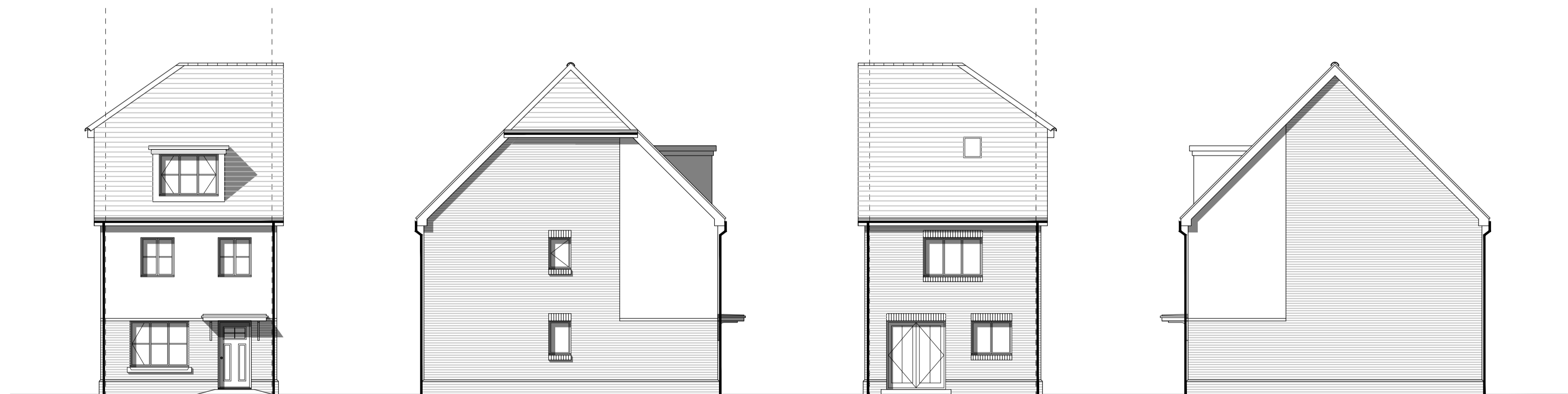
Front Elevation Plots - 125, 137, 138, 139 Handed - 124