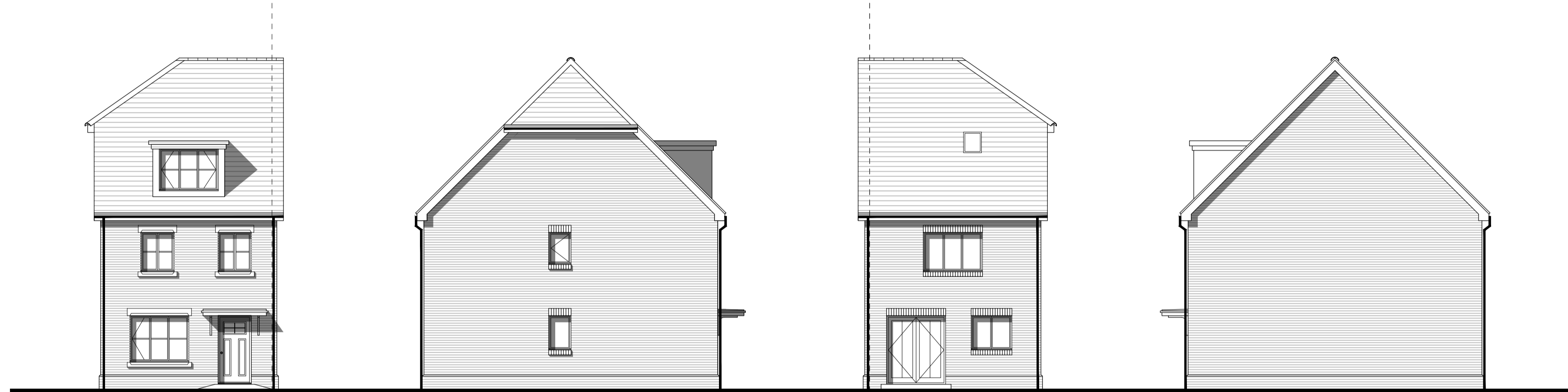
Front Elevation Plots - 123, 127, 131, 136 Handed - 122, 126, 130, 135

3-Bedroom House 134.43sqm / 1446sqft GFA (to be built) Plots - 123, 125, 127, 131, 137, 138, 139 Handed - 122, 124, 126, 130, 135