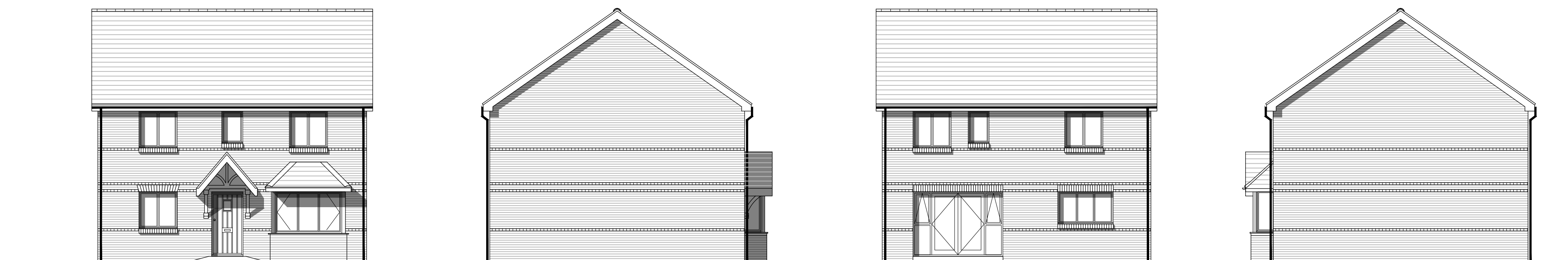
Front Elevation Plots 67, 70, 74