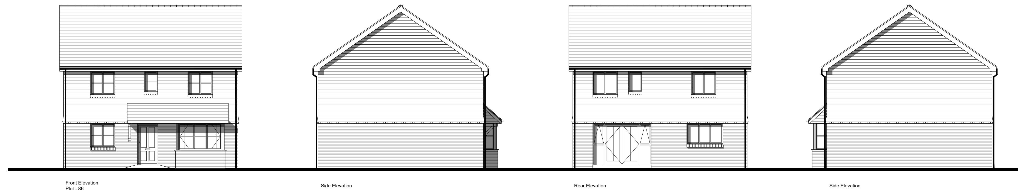
Front Elevation Plot - 86