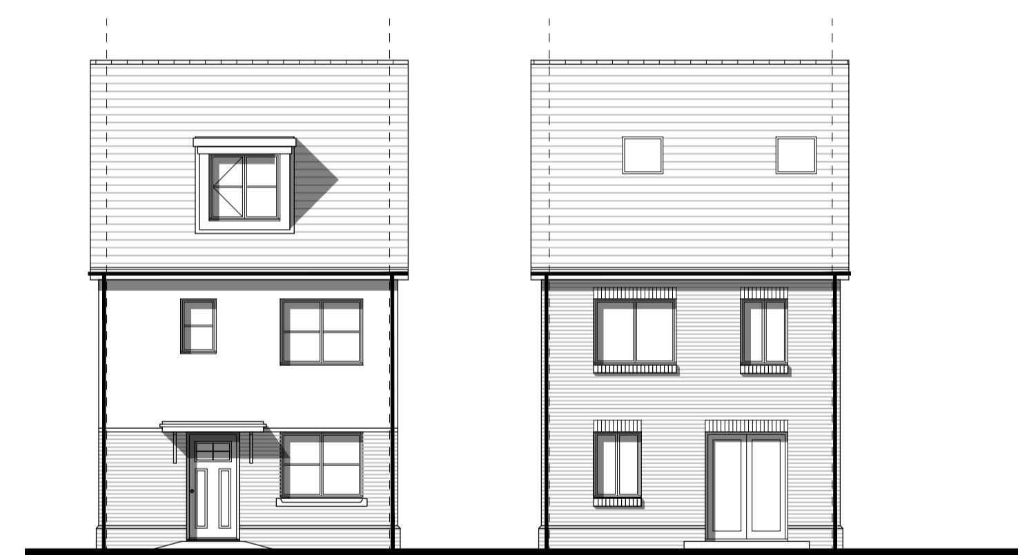
Front Elevation Plots - 133 Street