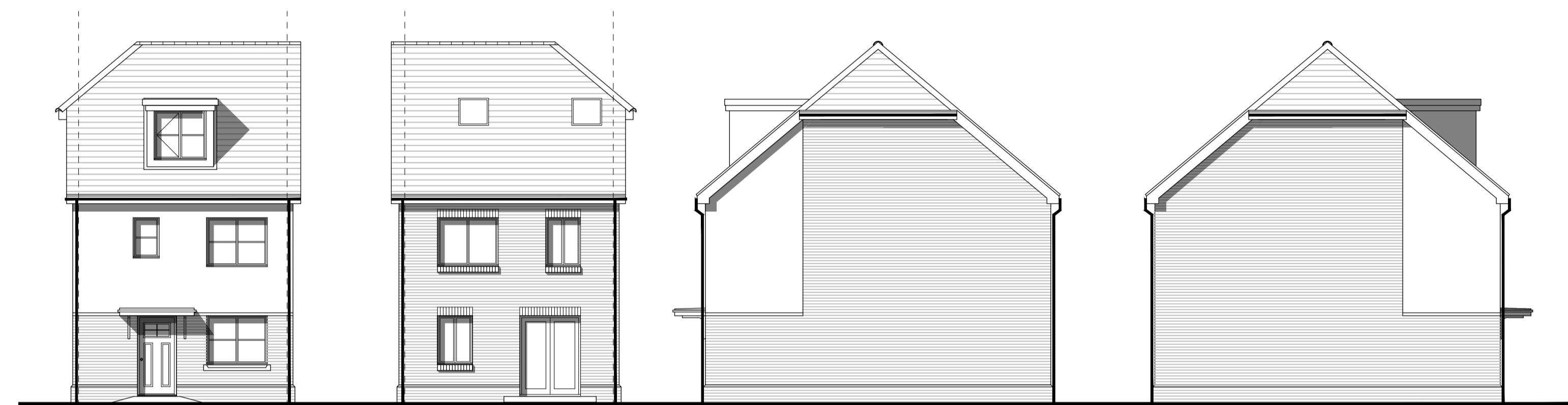
Front Elevation Plots - 134 Handled - 132 Street