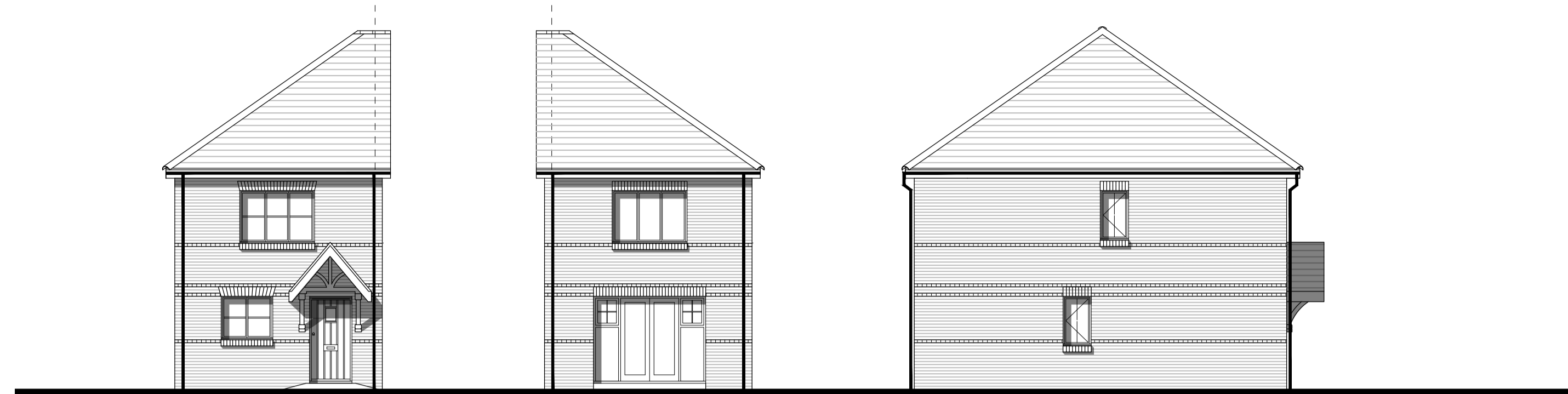
Front Elevation Plots - 7, 30 Handed - 6, 29 Rear Elevation Side Elevation