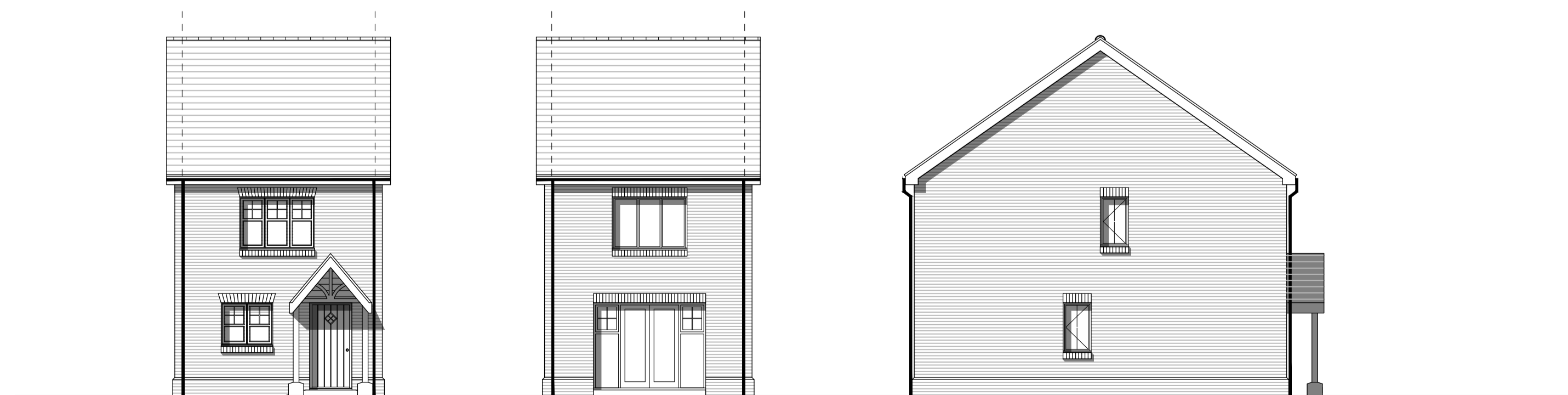
Front Elevation Plots - 148 Handed - 146, 147 Rear Elevation Side Elevation