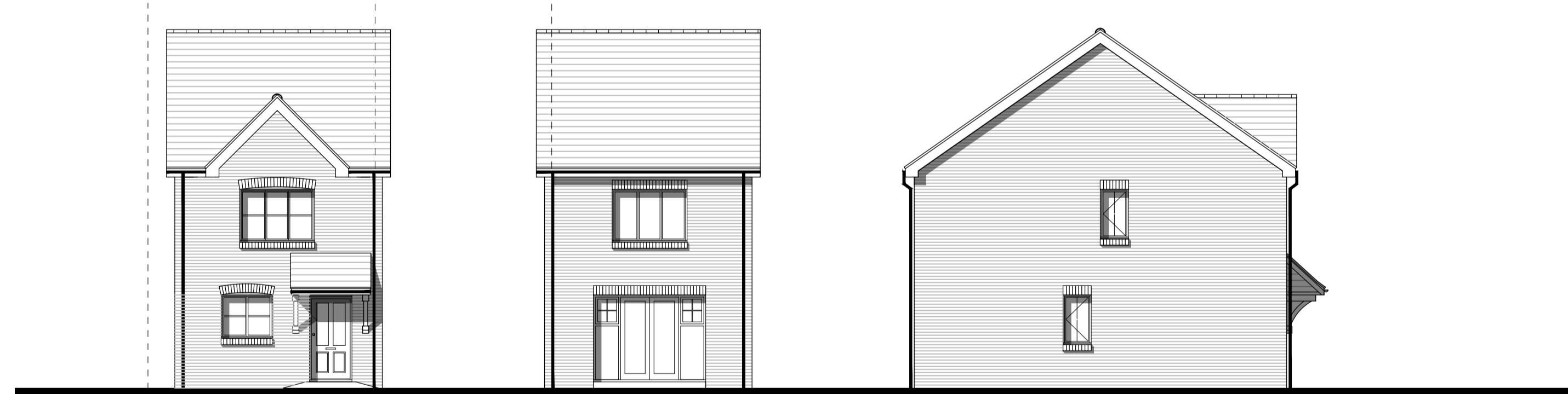
Front Elevation Plots 34, 38 Handed - 33, 37 Rear Elevation Side Elevation