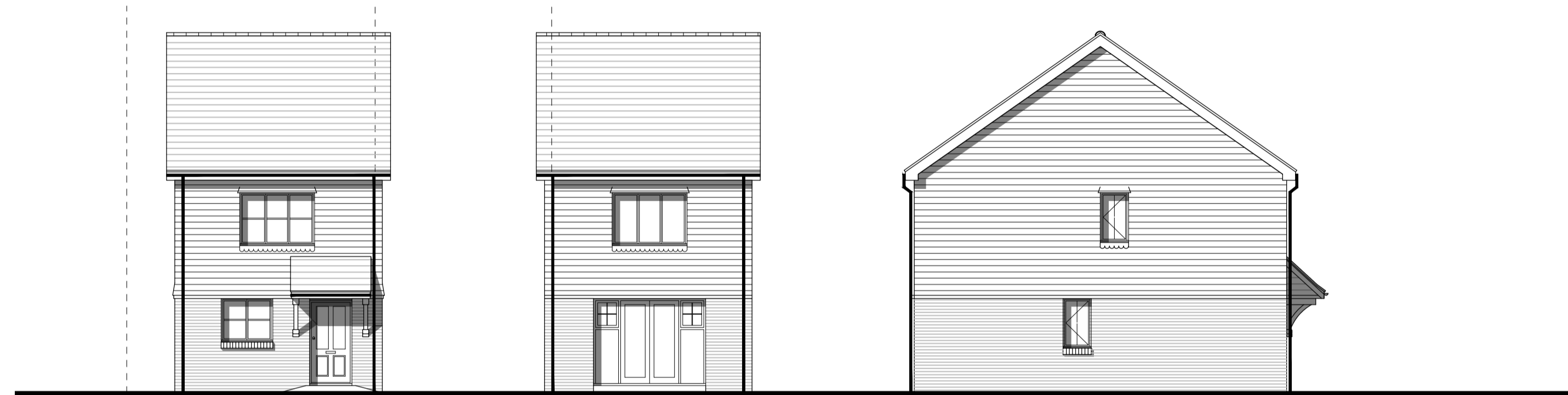
Front Elevation Plots 36 Handed - 35 Rear Elevation Side Elevation