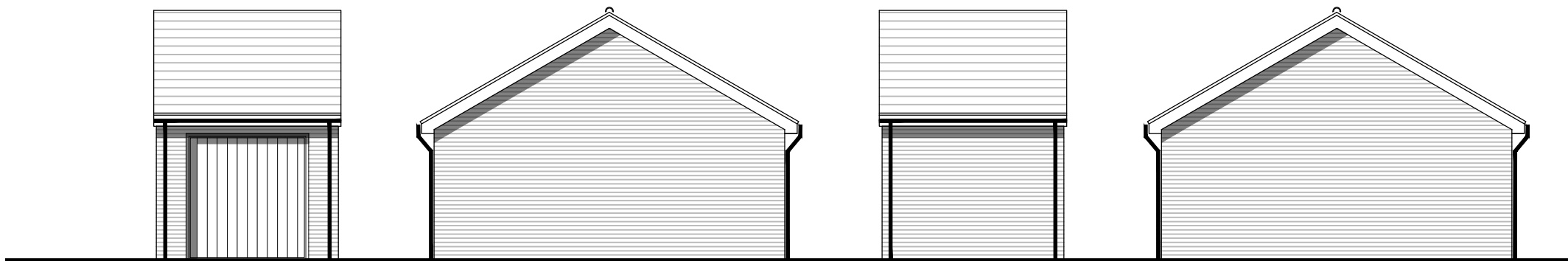
Front Elevation Plots - 1, 2, 3, 4, 5, 25, 45, 59, 67, 70, 74, 86, 98, 103, 112, 118, 120, 123, 129, 140, 141, 149, 150, 155, 156, 157, 158, 161, 193, 196, 201, 211, 214