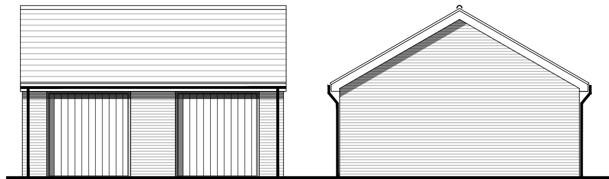
Front Elevation Plots - 8, 9, 31, 32, 39, 40, 41, 42, 89, 90, 93, 94, 104, 105, 108, 109, 114, 115, 116, 117, 121, 122, 156, 157, 160, 161, 192, 199, 200, 202, 203, 210, 212, 213