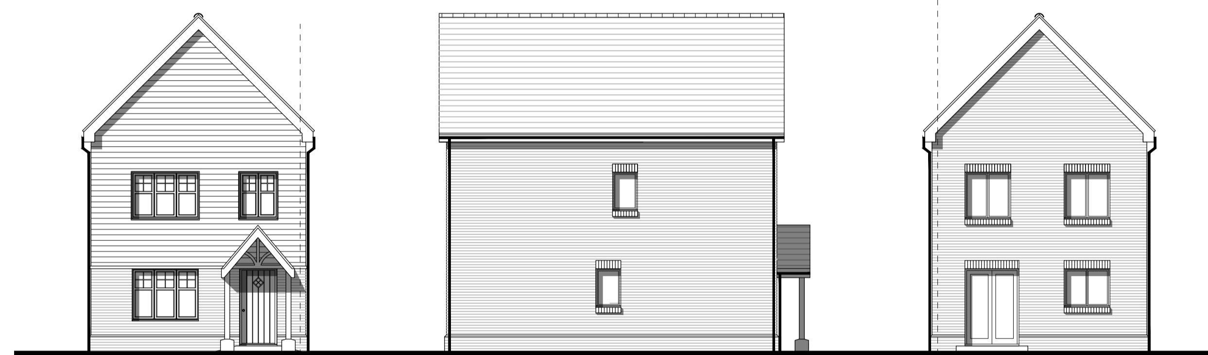
Front Elevation Plots - 99