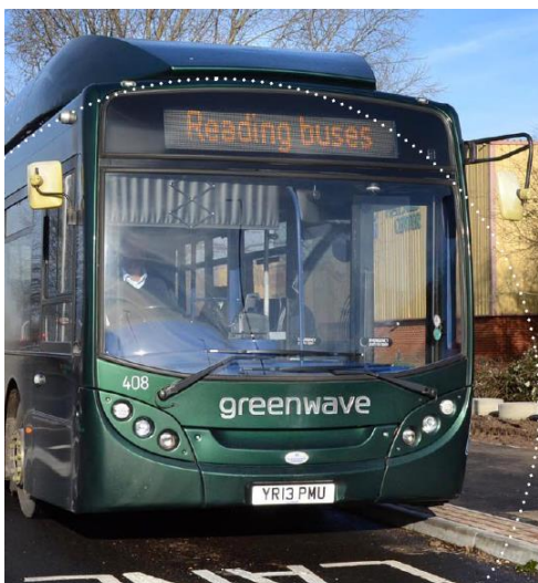
Figure 2: Reading is second only to Brighton & Hove for bus passenger journeys per head

get around. Mode share data suggests cycling accounted for 4.3% of all journeys in 2019 and that this increased to 6.7% in 2020. Ridership on public transport was inevitably suppressed during the lockdowns as people were discouraged from using public transport – bus use fell from 26.6% of all journeys in 2019 to 21% in 2020 and rail use from 19.3% to 12.3% over the same period. That said, pre-pandemic, Reading's high quality bus services consistently enabled it to buck national trends in declining bus use. And according to Government statistics on bus use ending March 2020 (the latest full year for which data is available), Reading was second only to Brighton & Hove in terms of bus passenger journeys per head of population for each local authority area in England (137 journeys per