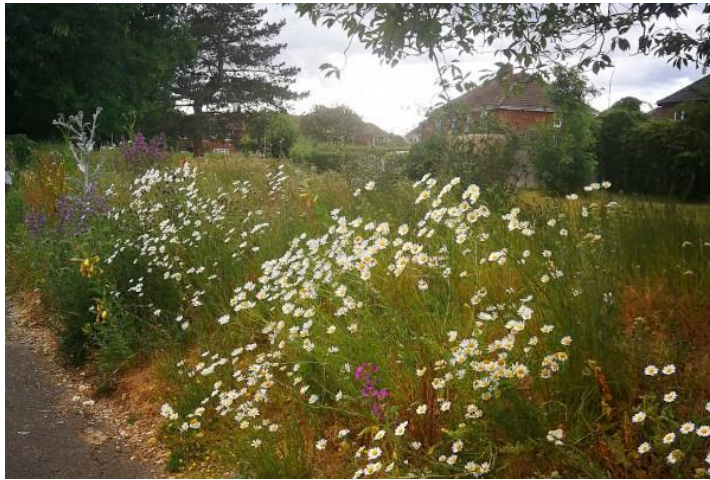
Figure 3: Landsdowne Road wildflowers following 're-wilding' trials