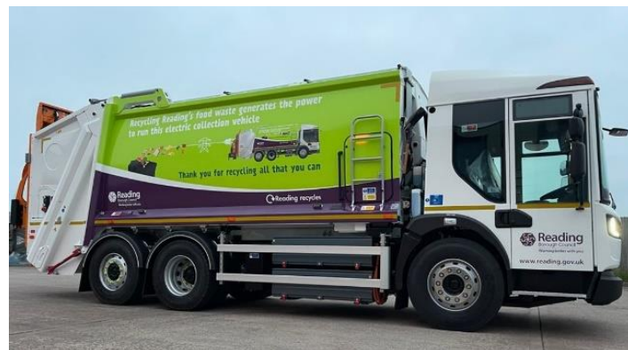
Figure 4: Reading Borough Council's first EV refuse truck arrived in September 2021 – powered by electricity generated from food waste