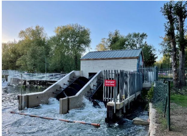
Figure 1: the new Reading Hydro turbines

turbines. The project, delivery of which was funded by £1.2m raised from public share issues, was driven forward by the volunteer-led Reading Hydro Community Benefit Society. The scheme will provide an estimated 320 megawatt hours of electricity per annum, and will save an estimated 5,600 tonnes of CO 2 over the 40 year design life of the project. The project became operational in September 2021, and the income from selling electricity will be used to operate and maintain the scheme, pay a modest return to shareholders and gradually repay their investment. After this, any surplus will be paid to a community benefit fund, to support local sustainability projects. At a broader scale, Reading has also secured over £5 million in Public Sector Decarbonisation Scheme funding to date (£3.4 by the University of Reading, and £1.7m by Reading Borough Council) to reduce emissions from public buildings.