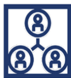
People and Places

The Reading Transport Strategy (RTS) includes five objectives that are considered as being integral to the delivery of policies and schemes that will be set out in the new transport strategy, these are: