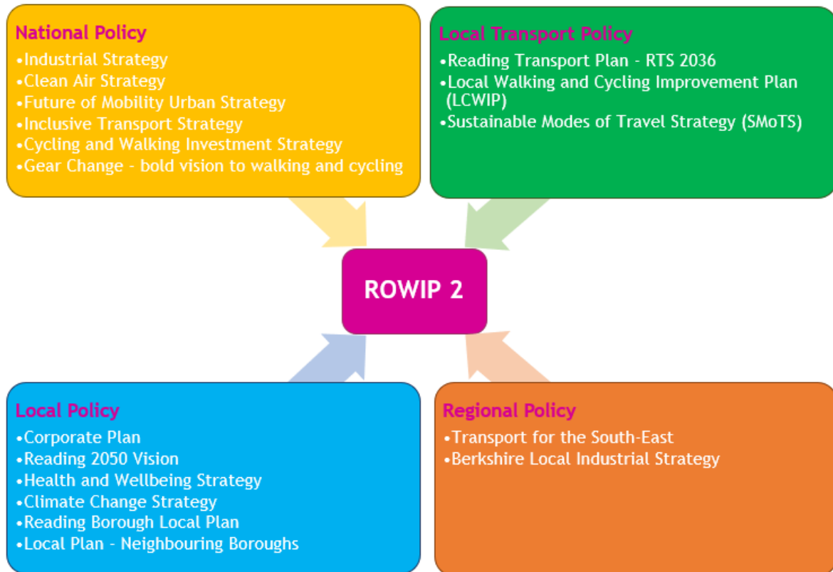
Figure 4.1: ROWIP2 link to national, regional, and local strategies

ROWIP2 supports key strategies and policies. The Council has ambitious plans to increase walking and cycling in the local and wider area, therefore these links will help ensure Rights of Way are enhanced as part of the wider walking and cycling network and contributes to wider initiatives. ROWIP2 supports the national, regional, and local policies as can be seen the figure below: