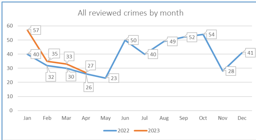
Chart 2. All reviewed crimes per month/year