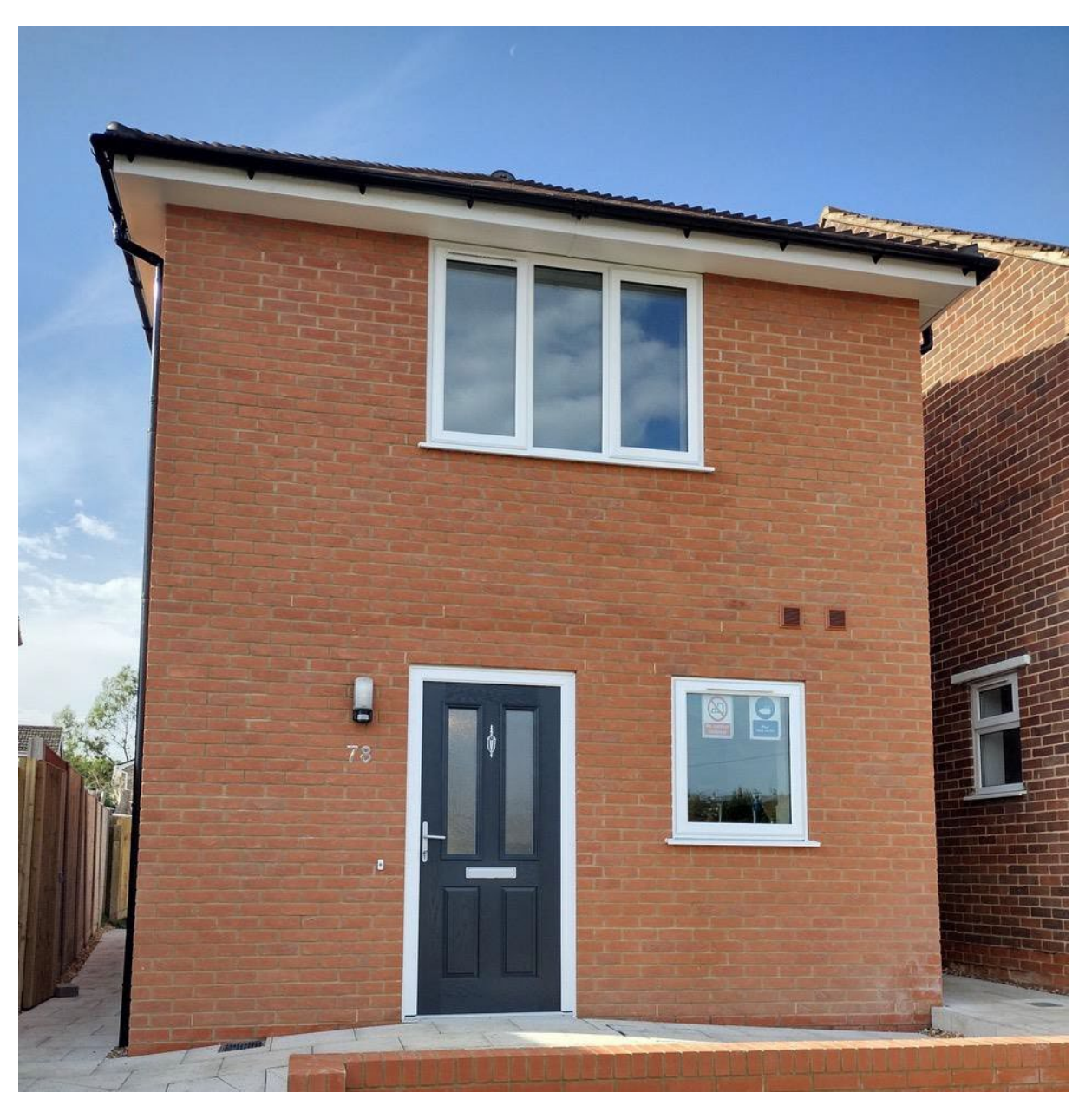
PART 3 - Choice Based Lettings - Homechoice at Reading

This section sets out how Reading Borough Council advertise and make decisions on who a vacant property is allocated to.